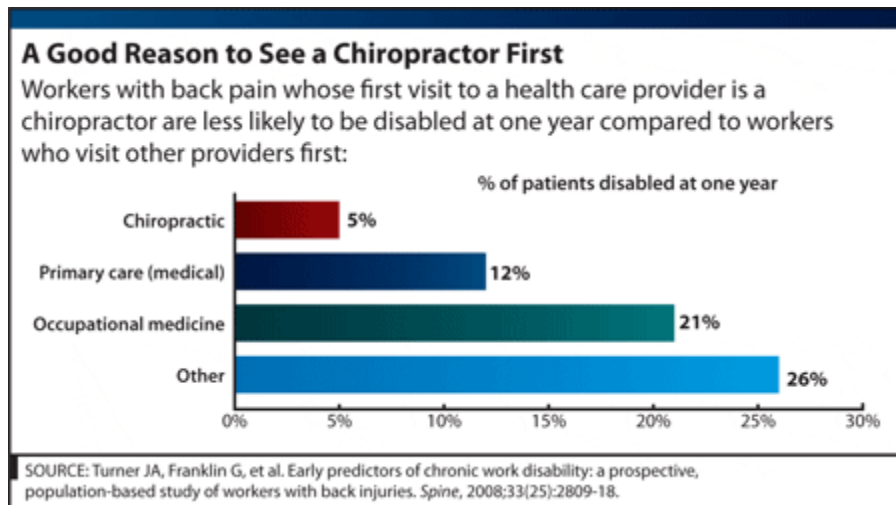
Table 1. 1

On behalf of a united chiropractic profession, this paper is offered as a means to substantively contribute to the national healthcare reform debate, to help foster timely action on key health reform principles, and to offer a new perspective on how a system in crisis can be redesigned into one that works, in which the public has confidence and which the nation and its citizens can afford.